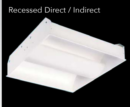
Recessed Direct / Indirect