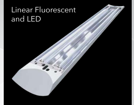
Linear Fluorescent and LED